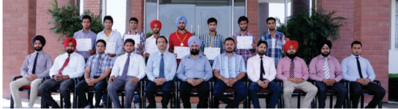
Launch of Annual College Magazine "Naviyan Paidaan"